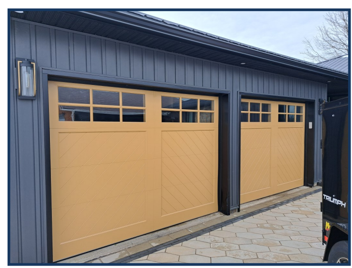
Use Extira on any of our door designs Finished using Sansin Enviro Factory Finish